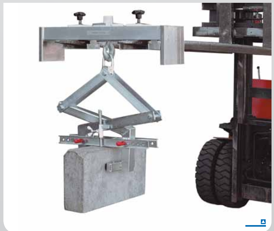
Aluminium Fork Mounted Hook with clamp (not included in delivery)